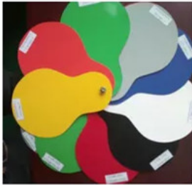
Oxford color shade