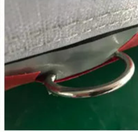
Floor d ring