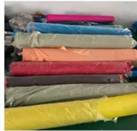
PVC raw material