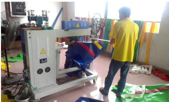
5, Testing 4-24hours(confirm all the functions are well)