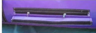
Zipper gas vent with safety cover