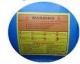
Safety warning sign