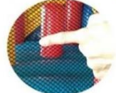
Protection safety net