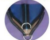
Strong fixation D-ring