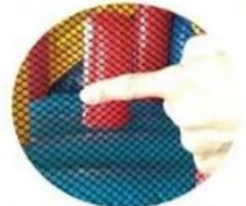
Protection safety net