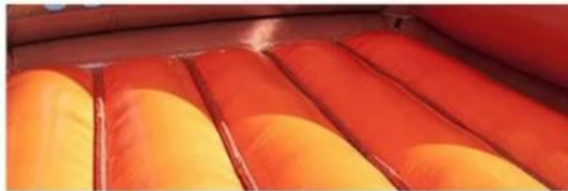
Double reinforced strips