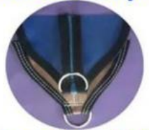
Strong fixation D-ring