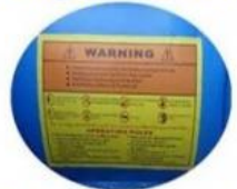
Safety warning sign