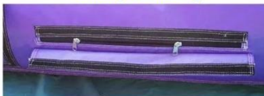
Zipper gas vent with safety cover