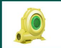
1 x 680W Blower