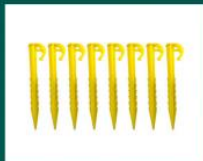
8 x Ground Stakes