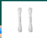
8 x String