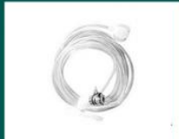
1 x Water Pipe