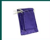
8 x Sandbag